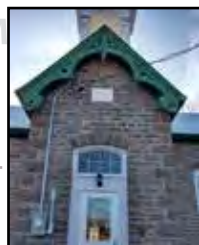
Oxford Mills, Maplewood Hall

10 am – 1 pm. Located beside the swing bridge, and once the home of the Bridge Master, it has been rented from Parks Canada since 1982 and used as a Public Library. The living area contains the circulation desk and adult fiction; the dining room is reserved for the children's area and three bedrooms upstairs hold teen and adult fiction and computers.